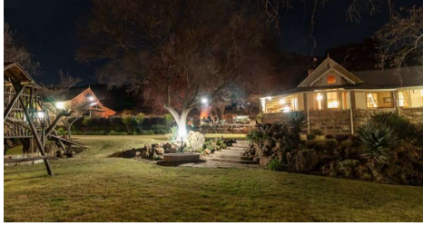
Main guest house