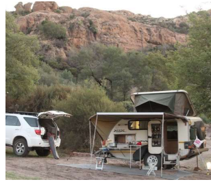
... and Caravan Park

Visit our Facebook page at https://www.facebook.com/plattelandtours to see more pictures of previous trips to this venue.